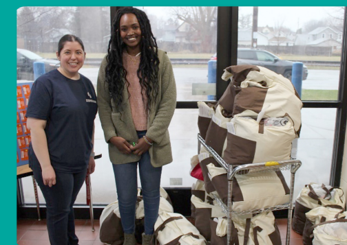
An Oshkosh Corporation volunteer and representative from Oshkosh schools prepare clothing for distribution

After the May event, we will take a break for the summer and are planning to expand this impactful program to other underserved areas in our community this Fall. More information soon!