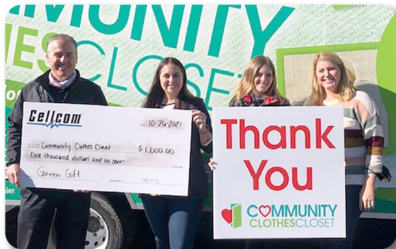
Cellcom donated $1,000 to help offset the cost of our recent conversion to solar energy.