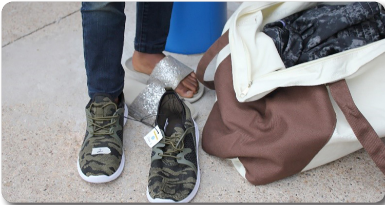
This boy arrived at the Traveling Closet in the only shoes he owned – a pair of silver sandals. He and his family recently relocated to Wisconsin and they were unprepared for the weather.