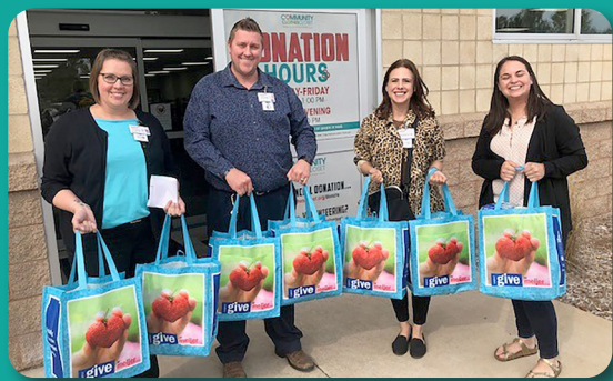
The team from Meijer Grand Chute stopped by with $500 in high need undergarments for kids and adults.

We are amazed every week by the number and generous spirit of our mission partners. Last year, 112 businesses, service groups and other charities saw the importance of our mission and wanted to help with financial support, in-kind donations or by volunteering – sometimes all three! When we consider what we have to be grateful for this year, our partners top the list. Recent examples include: